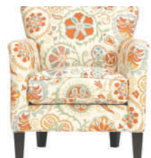
Parker chair ($699, www.crateandbarrel.com )