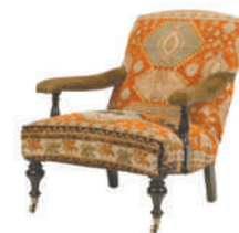
Camden chair ($2,995, www.jaysonhomeandgarden.com )