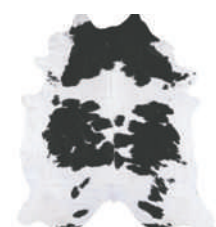
Koldby cowhide rug ($199, www.ikea.com )